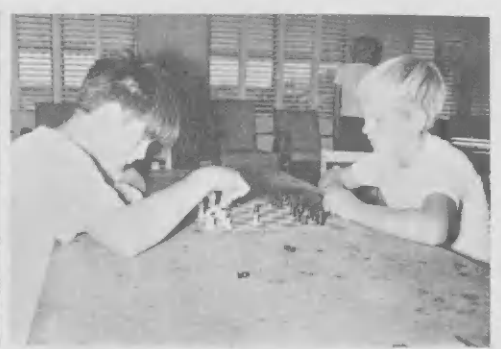
Young artists at work (l), future ballerinas at dance class (c), and much concentration here at chess tournament.